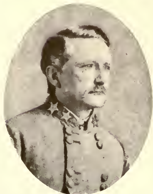
JOSEPH B. KERSHAW.